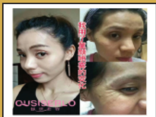
抚平皱纹 Smoothing Wrinkles