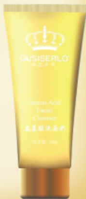
氨基酸洗面奶 Amino Acid Facial Cleanser