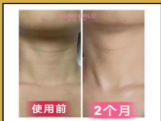
紧致颈纹 Improve Neck Lines