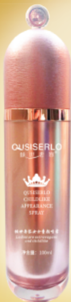
童颜喷雾 Childlike Appearance Spray