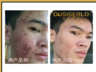
去疤印 Eliminate Scars